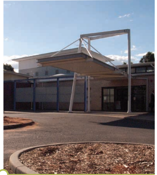
Nepean Cancer Care Centre

"The funds raised via the Radiation Oncology Network Trust Fund were due to the efforts of our dedicated network team of radiation therapists, medical physicists, nurses, supporting administration staff, and the senior and junior medical staff," he said.